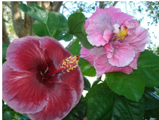
Romantique & Shelly Lorraine